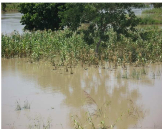
Figure 3. A picture of a farm flooded with water in one of the communities.

In table 3, households consented that floods destroy their livelihoods, farms, animals and small scale businesses and increase their vulnerability through impoverishment. Figure 3 is a picture showing a farm flooded with water in one of the communities. Flood water inundates farms especially along the valley areas causing massive crop failures and poor yields. Crops like maize, groundnut, millet, beans etc. suffer poor yields due to too much water and this threatens food security of almost every household in the study communities.